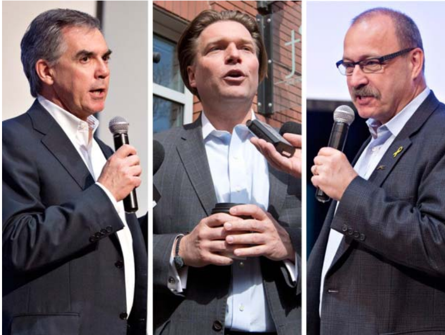
There are three men vying to become leader of the PC party, who will automatically become Alberta's next premier. Left to right: Jim Prentice, Thomas Lukaszuk and Ric McIver.

There have also been some cases of mistakes being made with voters' e-mail addresses, meaning the member didn't receive the information required to get a PIN and vote, he said.